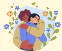
Increase Belonging for All