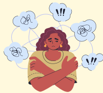
Reduce Problematic Internet Use