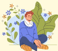
Promote Flexible Thinking