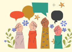
Advance Safety and Fairness